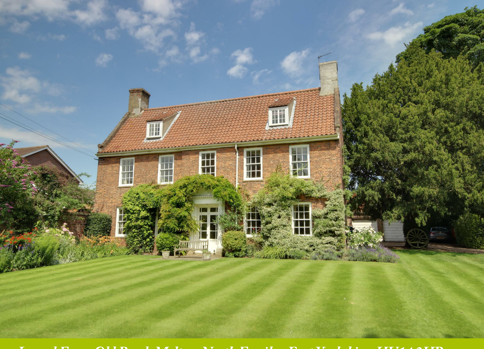
Laurel Farm Old Road, Melton, North Ferriby, East Yorkshire, HU14 3HP